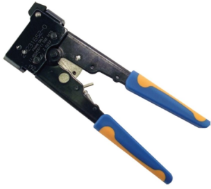
Modular Plug Hand Tool with 6 Position Reg Body Die, MP-66_-- Plugs, Blue Dot